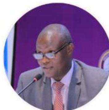
Session Chairperson - Hon. Justice Muzamiru Mutangula Kibeedi (JCOA)