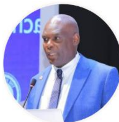
Session Chairperson: Hon. Justice Mike Chibita.

The Conference recommended the following to address normative and systemic barriers to a people-centered approach to justice.