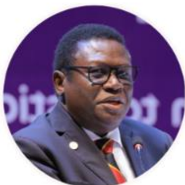
Hon. Norbert Mao