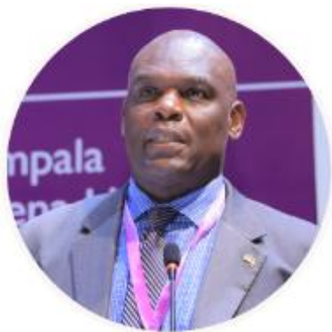
Presenter - Hon Justice Mike Chibita (JSC)