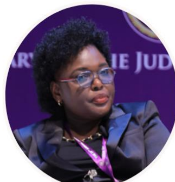
Session Chairperson - Hon. Lady Justice Catherine K. Bamugemeire (JSC)