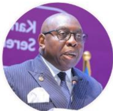
Presenter - Hon. Justice Geoffrey Kiryabwire (JCOA)