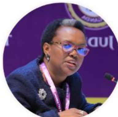
Session Chairperson - Hon. Lady Justice Patricia Basaza Wasswa (JHC)

Hon. Justice Flavian Zeija, The Hon., the principal judge, started his presentation by noting the mandate of the High Court under Articles 138 - 140 of the Constitution of Uganda. He stated that the court is decentralised into 38 Divisions and Circuits. However, only 24 High Court Circuits were operational.