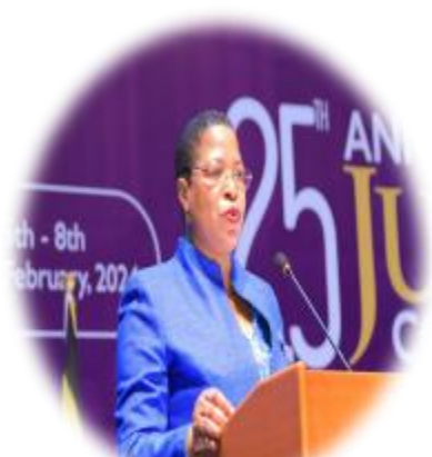
Rt. Hon Anita Annet Among

Official Closure - The Rt. Hon. Anita Annet Among, The Speaker of the Parliament of Uganda.