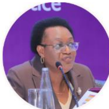
Session Chairperson: Hon. Lady Justice Irene Mulyagonja Kakooza (JCOA/CC)

The Chief Justice started his presentation by defining Alternative Dispute Resolution (ADR) as a way to resolve disputes without a trial. He listed the Common ADR processes, which include mediation, arbitration, and neutral evaluation. These processes are generally confidential, less formal, and less stressful than traditional court proceedings.