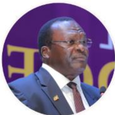
Presenter - Hon. Justice Alfonse Chigamoy Owiny - Dollo, Chief Justice