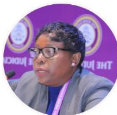
Session Chairperson - Hon. Lady Justice Eva K. Luswata (JCOA/CC)

Hon. Justice Dr Angelo K. Rumisha suggested the general strategies that Judiciaries can use to eliminate the backlog. These included-