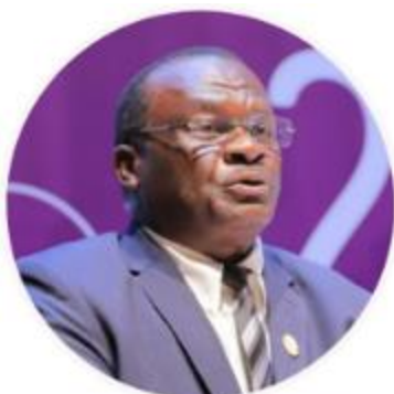
Hon. Justice Alfonse Chigamoy Owiny-Dollo

Remarks by Hon. Justice Alfonse Chigamoy Owiny - Dollo, The Hon. the Chief Justice