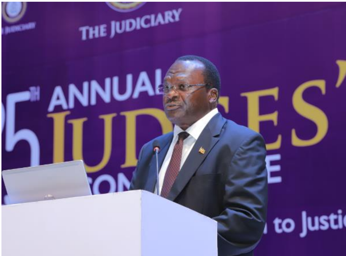
Hon. Justice Alfonse Chigamoy Owiny - Dollo, Chief Justice delivering his presentation at the 25 th Annual Judges' Conference.

The Chief Justice referred to the United Nations Sustainable Development Goal (SDG) No. 16, which is in line with the Third National Development Plan 2020/21-2024/25 (specifically the Administration of Justice Programme) and the Judiciary's Fifth Strategic Plan 2020/21-2024/25.