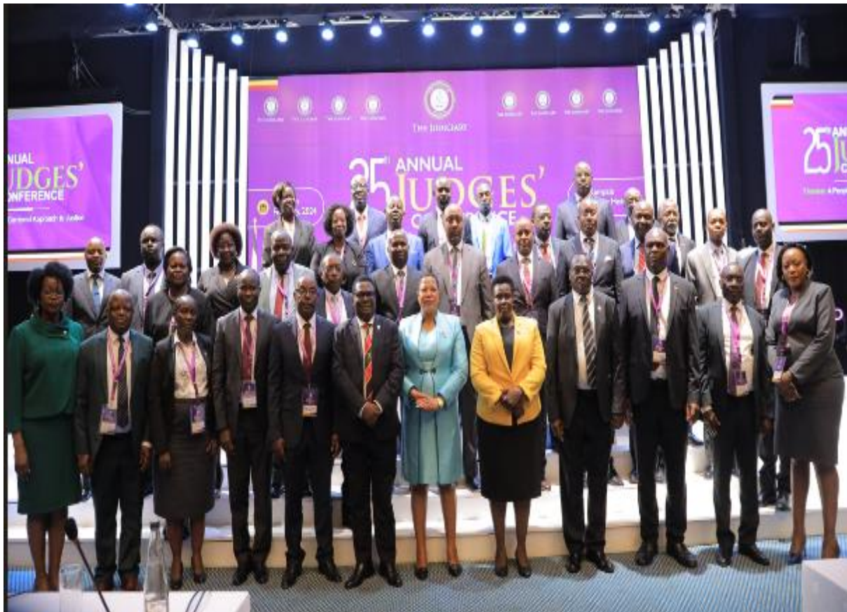
Judges from High Court Circuits pose for a picture with HE the Vice President, the Rt. Hon Speaker, The Hon. The Chief Justice, the Minister of Justice & Constitutional Affairs, The Hon. Principal Judge, and the Chairperson Governing Council of the JTI