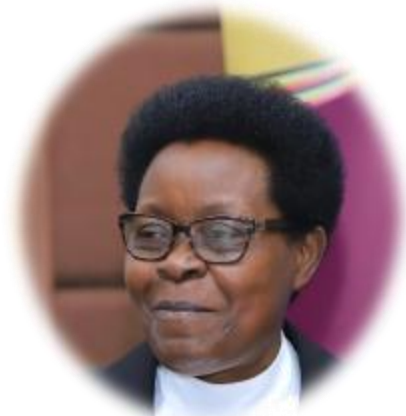
Hon. Justice Damalie N. Lwanga