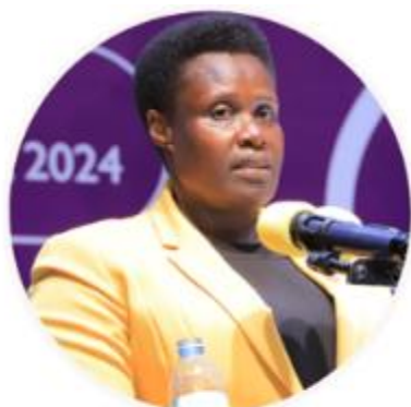
H.E Major Jessica Alupo (Rtd.) The Vice President of the Republic of Uganda

Official opening by the Guest of Honour, The Vice President of the Republic of Uganda - Her Excellency Major Jessica Alupo (Rtd.)