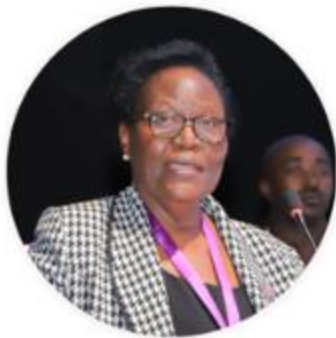
Hon. Lady Justice Faith Essy Mwendha (JSC).

The opening ceremony started with a prayer led by Hon. Lady Justice Faith Essy Mwendha (JSC).