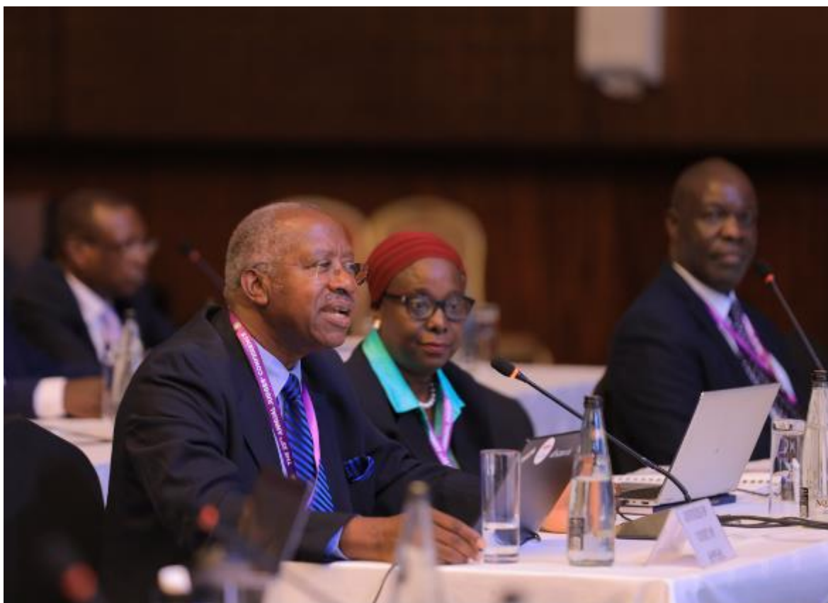
Hon. Justice Martin Stephen Egonda-Ntende (JCOA) reacts to the presentations on the performance of appellate courts during the plenary

Hon. Justice Martin Stephen Egonda-Ntende (JCOA) volunteered to support both the court of appeal and the Supreme Court work to solve the problem of lack of court records or incomplete court records. The Hon the Chief Justice welcomed this offer.