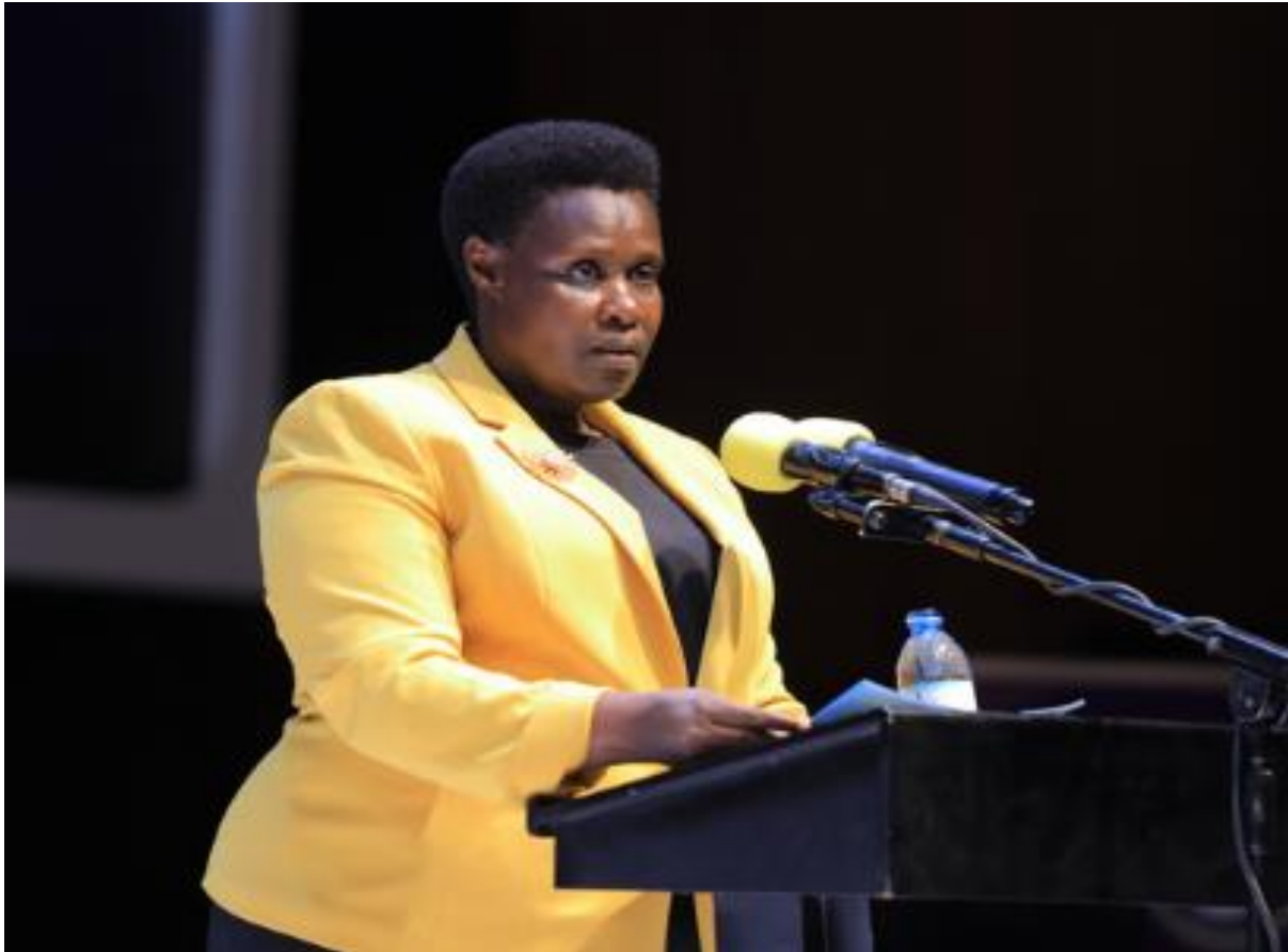
The Vice President of the Republic of Uganda - Her Excellency Major Jessica Alupo (Rtd.) at the Official opening of the 25 th Annual Judges Conference

The Vice President emphasised that the people legitimise judicial power. Therefore, the courts should exercise this power in the people's name by considering their values, norms, traditions and aspirations. She stated that the people of Uganda would like the timely resolution of disputes, respect and simplified processes.