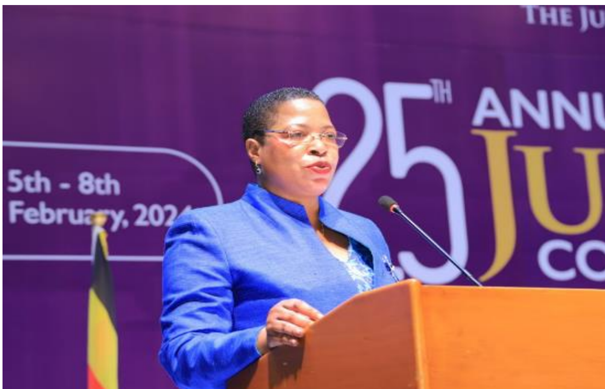
The Rt. Hon. Anita Annet Among, The Speaker of the Parliament of Uganda at the Official Closing of the 25 th Annual Judges Conference.

Hon. Among said that her presence at the Conference cements the fact that the two arms of government can work together without interference. She advised the Judiciary to share its challenges with the Parliament for possible solutions. She committed to efficiency and effectiveness in making Uganda a beautiful place to live. She highlighted that the presence of retired justices was particularly encouraging since they are vital in experience sharing. She wished the delegates a successful 2024 in dispensing justice to the people, and declared the 25th Annual Judges Conference closed.