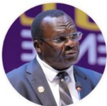
Hon Justice Alfonse Chigamoy Owiny – Dollo. The Hon. the Chief Justice

He mentioned that it is wrong to condemn judges based on judgements only without considering the whole process and all stakeholders. He reiterated that it is terrible for a judge to be removed from their seat to propel political purposes. He added that impeaching judges based on public labels or perceptions or attacking judges physically or verbally is uncalled for, but reiterated that it is essential to maintain Judicial independence to acquire judicial accountability.